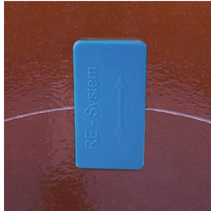
RE-system (blue) for stainless steel coupling and flexible couplings Type 2B