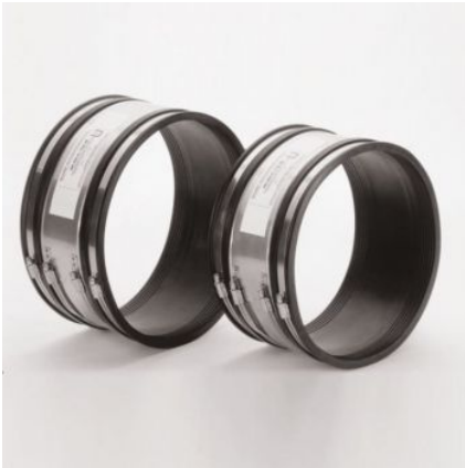
Flexible Couplings Type 2B